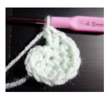
2 tr into next 3 stitches 2 hdtr into next 6 stitches 2 dtr into next 6 stiches

Row 1 ch2, htr into same stitch, 2htr into next 2 stitches, 2 tr into next 3 stitches do not join but carry on working in the same direction to make a spiral